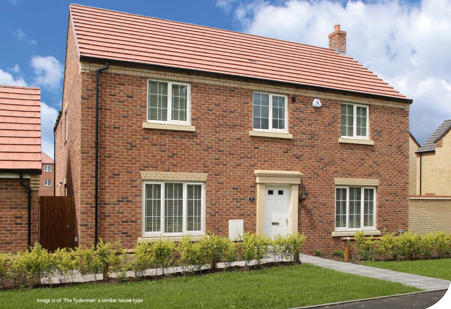
Image is of 'The Tyderman' a similar house type